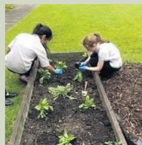
CLASS ACT St Oswald's girls pull out weeds

your compost heap, apply it as a mulch or soil conditioner in your borders, or even sprinkle it over your lawn as a top dressing. Growbags were created for a simple and singular purpose, but their uses in the garden are now manifold. And, as with many things in the garden, with some creative thinking we can ensure we get the most out of our resources. So get out there and do some great growbag growing.