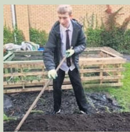
KEY CATEGORY Pupil at St Oswald's rakes up

have been motivated and engaged. They can now make the link between what they are growing and what they can cook in class from the produce. "It has been a catalyst for growth, increasing parental engagement and partnership with our local community, and it has helped some of our less academically engaged pupils." Follow Cultivation Street on Twitter, Facebook and Instagram - or go to cultivationstreet.com for more.