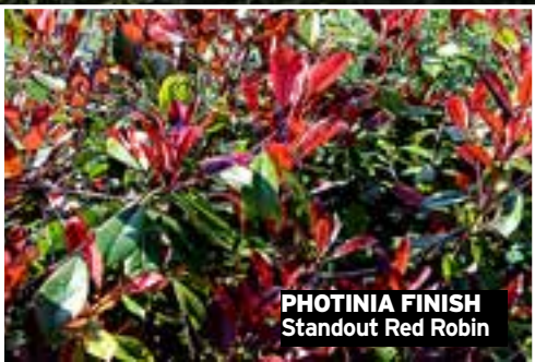
PHOTINIA FINISH Standout Red Robin