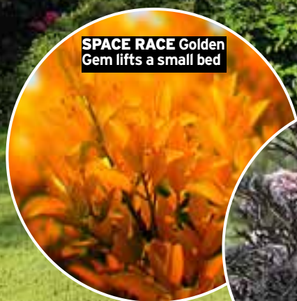
SPACE RACE Golden Gem lifts a small bed