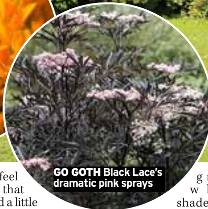
GO GOTH Black Lace's dramatic pink sprays