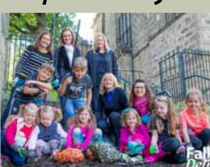
GROW GETTER School team in Falkirk