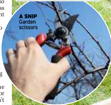
A SNIP Garden scissors