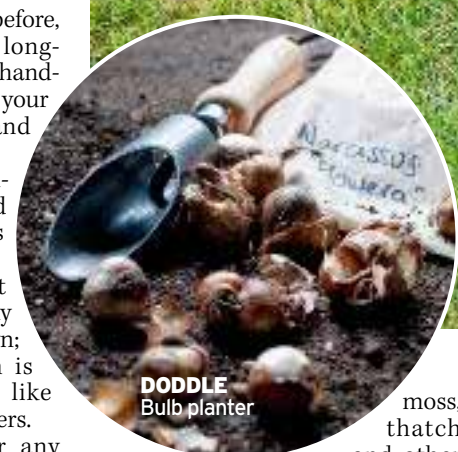
DODDLE Bulb planter

moss, thatch and other creeping weeds from underneath the grass.