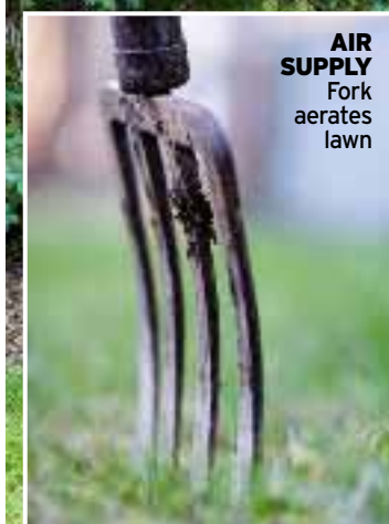
AIR SUPPLY Fork aerates lawn

If you have a lawn, you'll also need a rake to remove leaves and scrape out moss from underneath the lawn. A spring-tine rake is perfect for removing leaves and debris while a scarifying rake is a bit more heavy-duty and is generally used to draw out