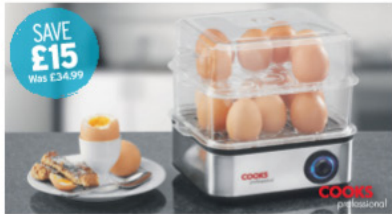
SAVE £15 Was £34.99 TWO TIER EGG BOILER AND POACHER Now £19.99 plus £3.95 p&p

Whether you want soft boiled eggs, hard boiled eggs or anything in between, this electric boiler will boil up to 16 eggs at once with its versatile, dual layered design. It comes with a four-section poaching tray in which you can poach eggs or make tasty omelettes without the hassle and mess of traditional methods.