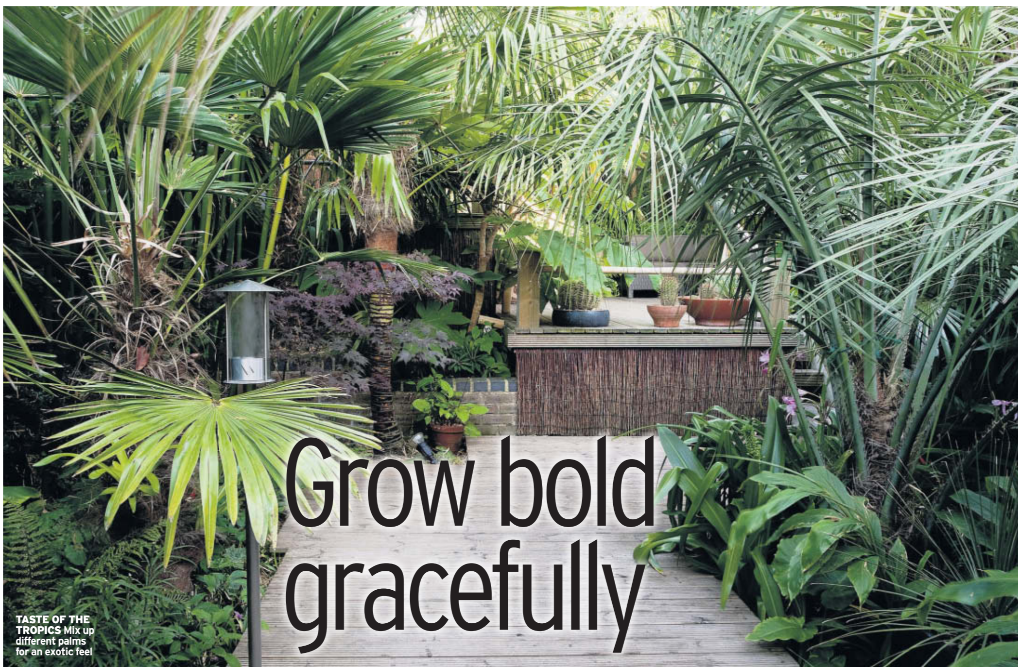
TASTE OF THE TROPICS Mix up different palms for an exotic feel

Of course, no Italian terrace would be complete without the familiar warm hue of terracotta pots. Mix in