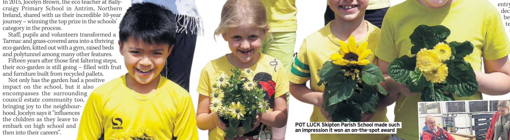
POT LUCK Skipton Parish School made such an impression it won an on-the-spot award