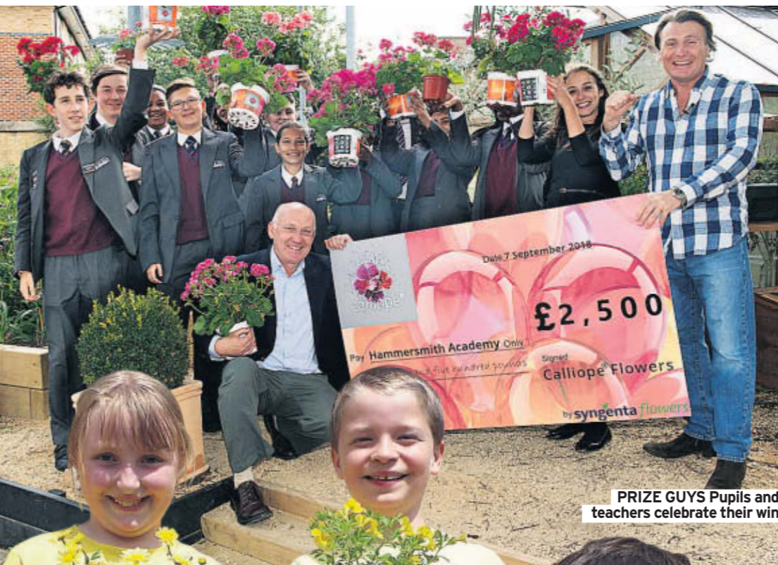
PRIZE GUYS Pupils and teachers celebrate their win

This category rewards gardens that have been created to have a positive impact on mental or physical health. 1st prize - £1,000,