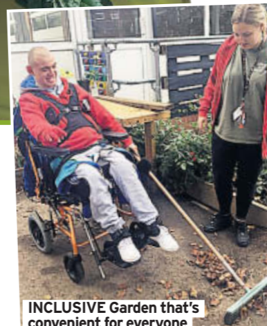
INCLUSIVE Garden that's convenient for everyone