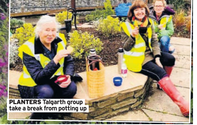
PLANTERS Talgarth group take a break from potting up

welcome and ensure people feel like they have a place to go. They grow their food with the aim of providing it to those who need it most and create a space for those who feel isolated to meet new people.