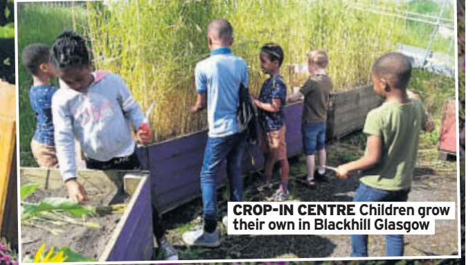
CROP-IN CENTRE Children grow their own in Blackhill Glasgow