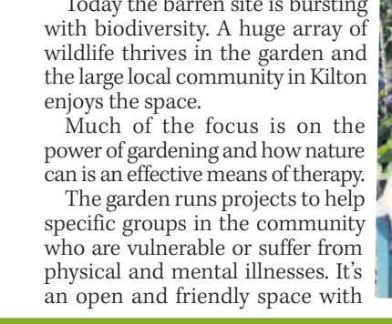
THERAPY Proud Midlands team in their OASIS of calm

Midlands OASIS Community Gardens, Worksop, Notts This community garden was started a decade ago when the team took over a derelict youth club and an abandoned recreational field. Today the barren site is bursting with biodiversity. A huge array of wildlife thrives in the garden and the large local community in Kilton enjoys the space. Much of the focus is on the power of gardening and how nature can be an effective means of therapy. The garden runs projects to help specific groups in the community who are vulnerable or suffer from physical and mental illnesses. It's an open and friendly space with