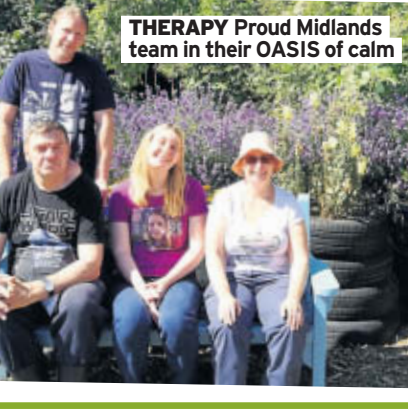
THERAPY Proud Midlands team in their OASIS of calm

South Clitterhouse Farm Garden, Cricklewood, North London This garden was launched in 2017 by people passionate about encouraging