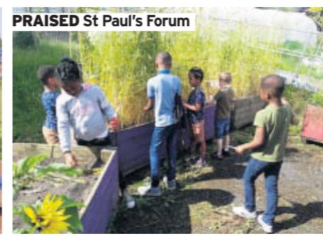
PRaised St Paul's Forum