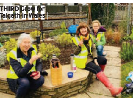
THIRD City of Talgarth in Wales

For loads more hints and tips on gardening visit daviddomoney.com or follow me on Facebook at @DavidDomoneyTV or on Twitter @daviddomoney