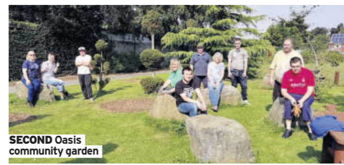
SECOND Oasis community garden